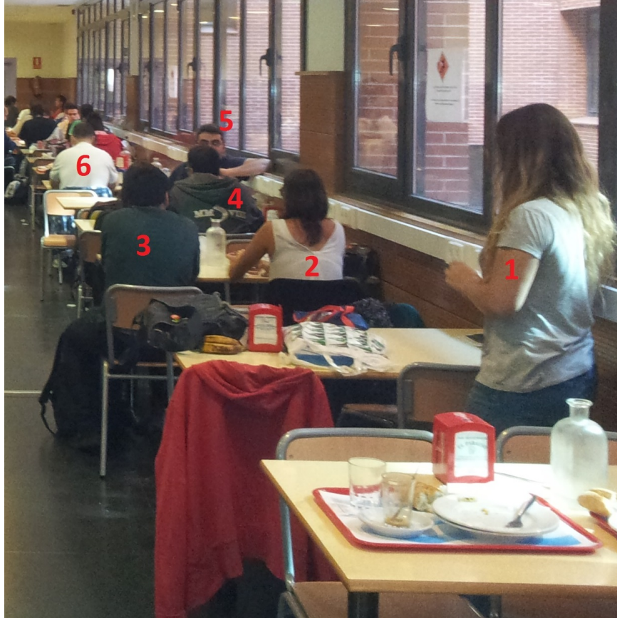
Figure 1: Sample scene used in the first study

correct girl, even though, out of all the girls, she was the one that was the furthest away from the observer. 23% chose a girl with dark (not black) hair, closer to the observer than the right girl. Two people chose a blond girl at the front of the photo, and two more did not know the answer. From these answers we can see that people tend to focus on what they see first. For this reason, it may be a good idea to provide more details than necessary when describing a person that is further away.